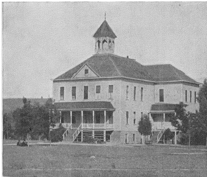
GRAYSVILLE ACADEMY, GRAYSVILLE, TENNESSEE First Important Educational Unit in the South